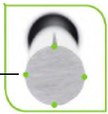
position of vent areas and depth of the vent areas: 0,02mm +/-0,01